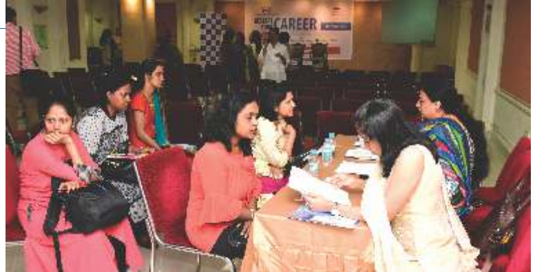
Participants interacting with the companies

The IMC Ladies' Wing with a vision to facilitate women to become more independent and self-sufficient organized an event "Restart Your Career" to ease the process of hiring. About 60-odd women participants took part in the event. Top corporates such as Tata Group, Godrej Industries, Sula Vineyards, Ugam solutions, Antarang Foundation, Export Accelerator and others were the companies that were present. The spokespersons from respective companies explained the women participants about how their companies go about the hiring process. Post the interactions, interviews with several candidates were taken.