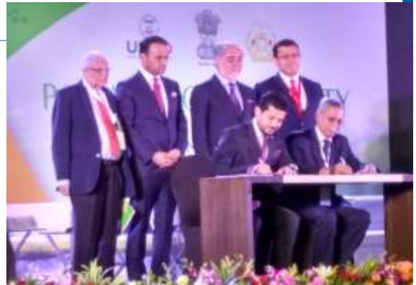
IMC signing MoU with Afghan Chamber of Commerce & Industry