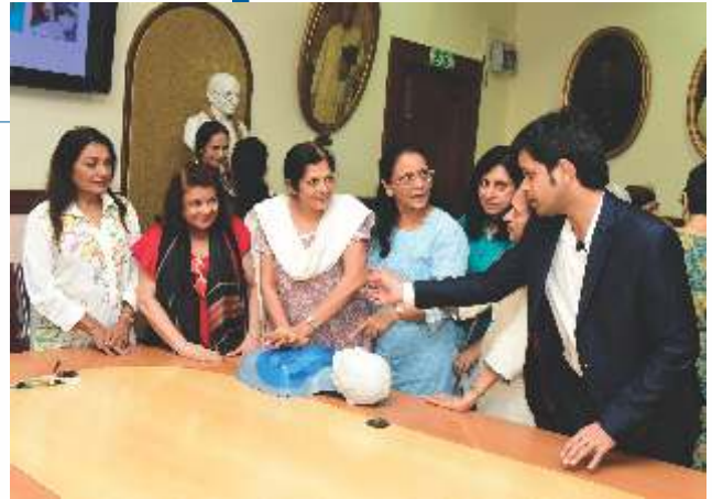
Doctor from Dr. B. K. Goyal Heart Foundation teaching members the CPR techniques

Members got hands on learning of lifesaving technique which gives a person suffering a cardiac arrest an increased chance of survival till professional help reaches to revive and stabilize the patient.