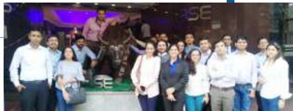
Young Leaders' Forum group photograph at BSE

Talking to the members he said that the youth need to come out of our social and societal dogmas and young entrepreneurs and professionals have the ability to break the shackles of the old philosophies. To achieve this youngsters need to come out of the old thought process and need to share the knowledge with others and not hound on the old rigid ways. He mentioned technology comes in waves and that change in job and GDP takes place rapidly. He concluded by saying that we are staying in capitalism's capitalist economy that is based on non-linearity and here everything is a matter of luck and not