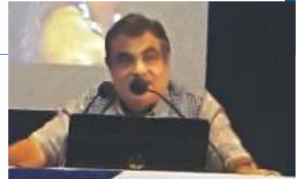
Shri Nitin Gadkari