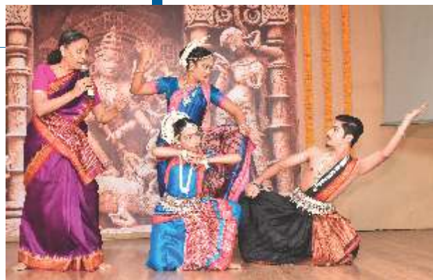
Various forms of Dances of India