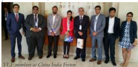
YLF members at China India Forum

IMC Young Leaders' Forum (YLF) members participated in the 7th China India Forum hosted on 26th and 27th October 2018 at Hyatt Regency, Pune, Maharashtra. The theme of the forum this year was Innovation, "Jointly Shoulder Responsibility of our times, Promote Global Growth" and the focus was to promote beautiful China and wonderful India.