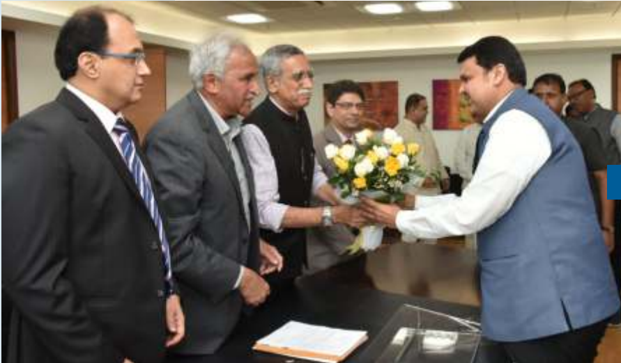
Meeting with Hon'ble Chief Minister of Maharashtra, Shri Devendra Fadnavis - September 4, 2018